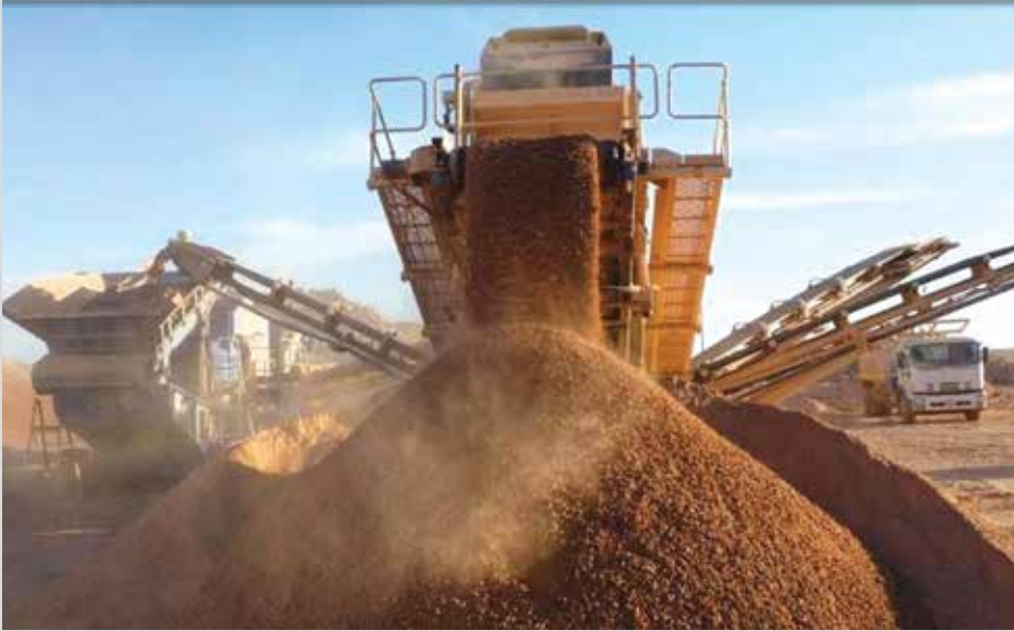
In action at Barrow Island